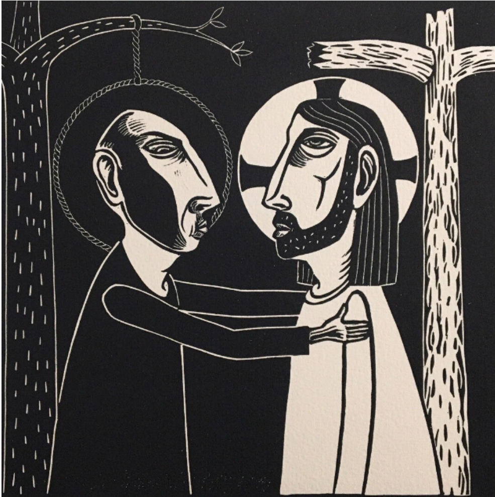
Judas Betrays Jesus Kreg Yingst