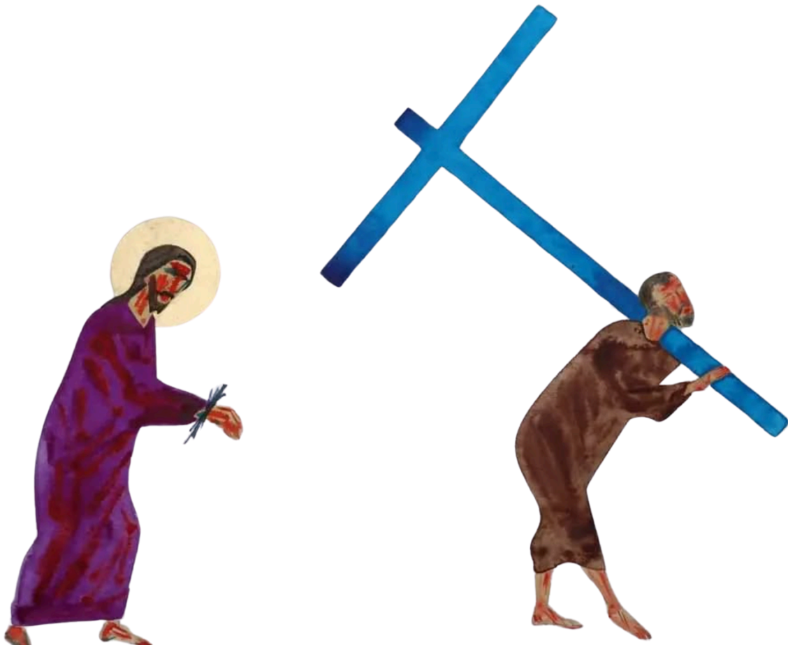
The Road to Calvary Danylo Movchan