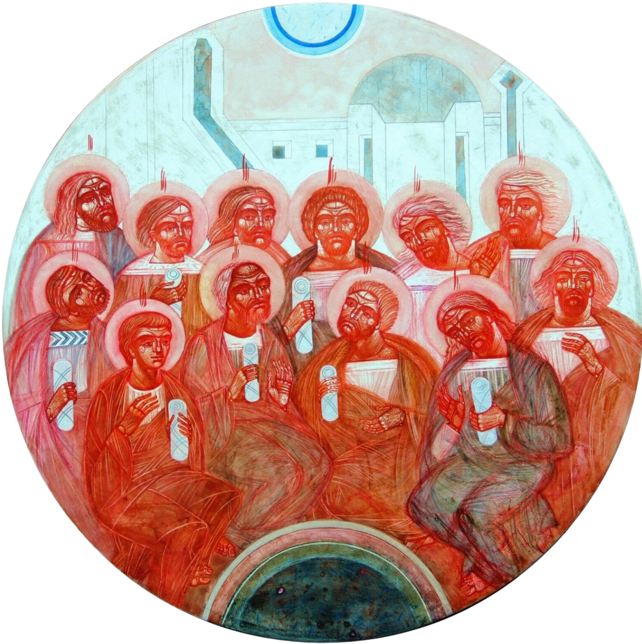
Pentecost Ulyana Tomkevych