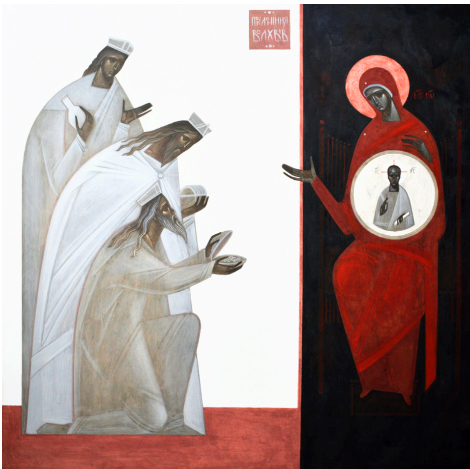
The Adoration of the Magi Khrystyna Kvyk